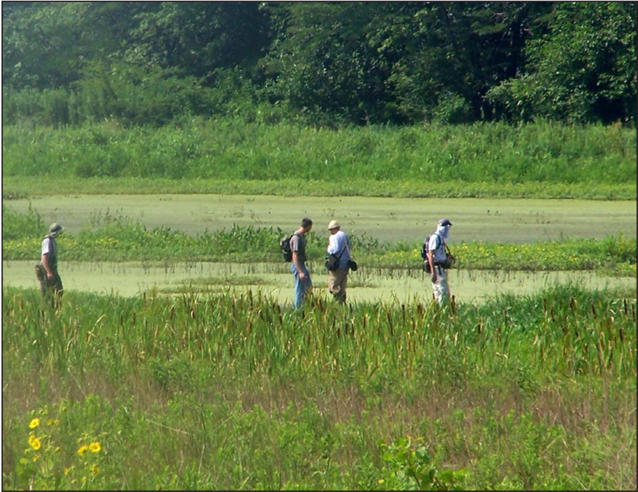
Members of the plant team.