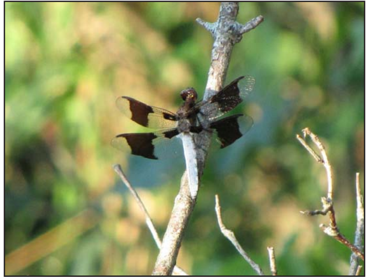
Common white tailed dragonfly.