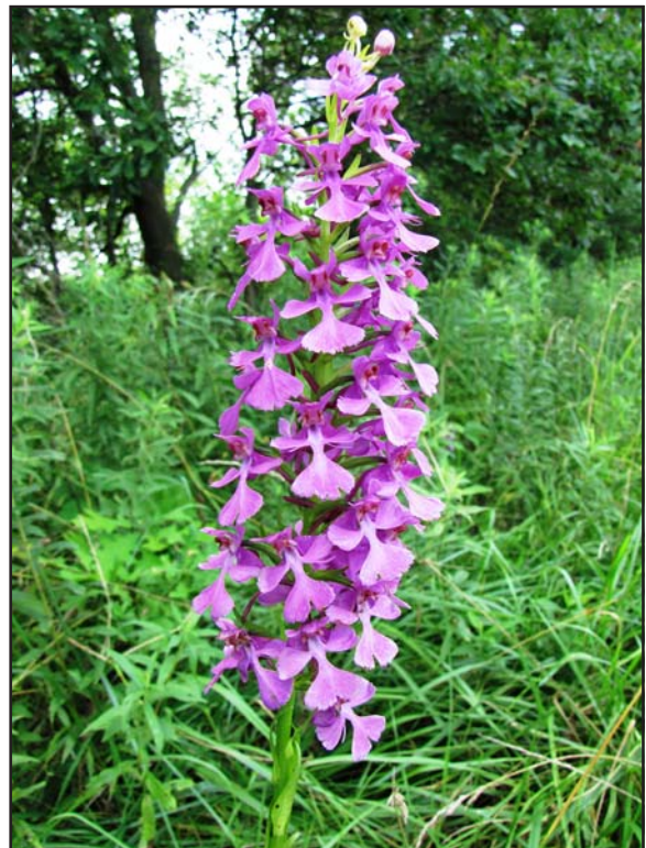
Platanthera peramoena , purple fringeless orchid found during the Goose Pond Fish and Wildlife bioblitz. See pages 12-15.

After 89 vigorous years, he died on June 11, 2010, at Bell Trace Health and Living Center.