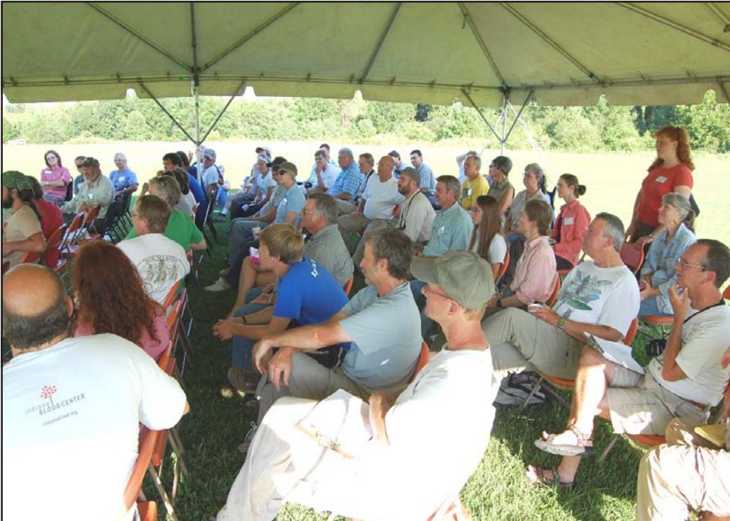
Volunteers listening to the reports from the various taxonomic groups.

them in the conservation and management of Indiana's public natural areas. To learn more about Goose Pond FWA please visit http://www.in.gov/dnr/fishwild/3094.htm or Friends of Goose Pond at http://friendsofgoosepond.org/ .